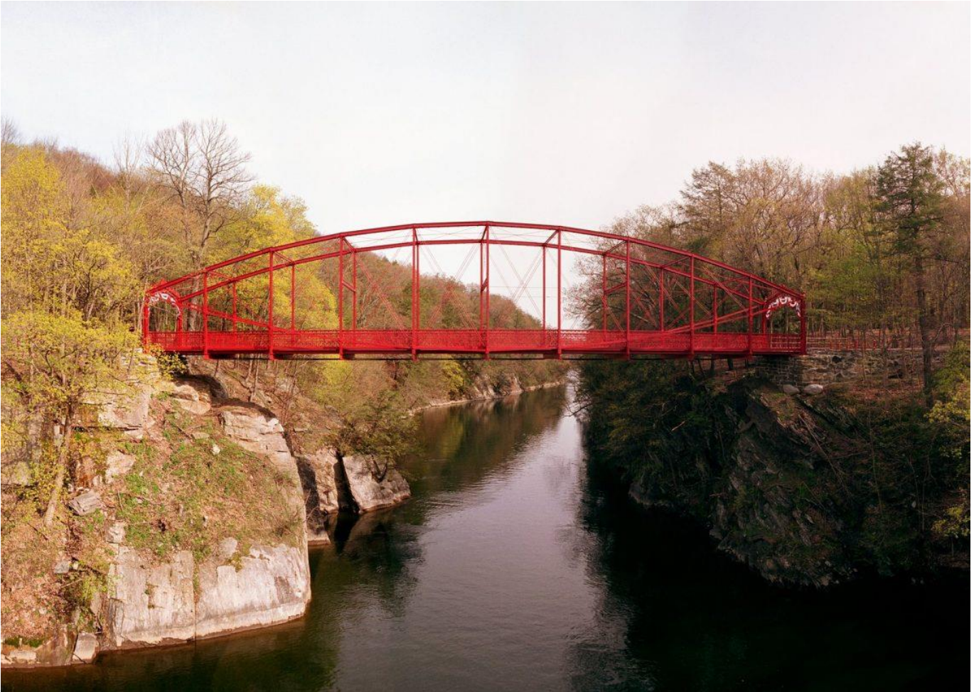
The 1895 iron bridge at Lover's Leap, New Milford

Date: to be announced. While our meeting has been postponed, the speakers and site are ready to go when we can set a new date. Here's what we have in store for you: